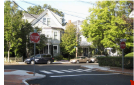
Public realm improvements, including curb extensions and streetscaping elements, are being considered.